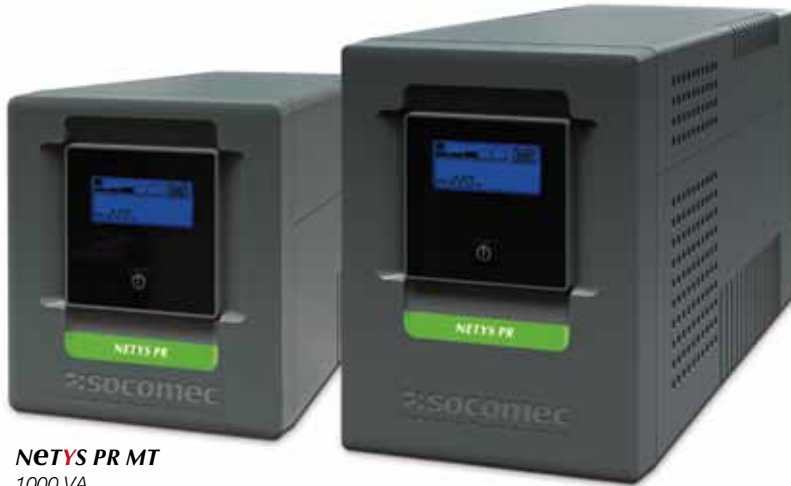
NETYS PR MT 1000 VA